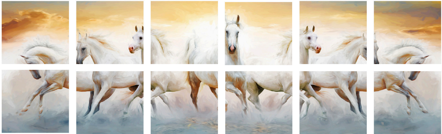
Panel Matching (With Gap)