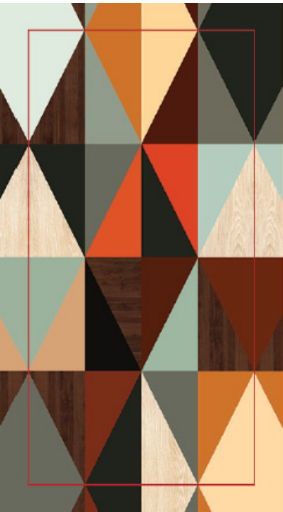
Single Image (showing mirror bleed)